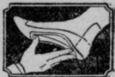
Dr. Scholl's Foot-Ezzer quickly relieves tired, aching feet, restores weak and broken down arches. Worn in any shoe. $3.50 per pair.