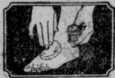
Dr. Scholl's Foot Balm soothes, cools, cures and keeps it tender, tired, aching, burning feet. 35c per jar.