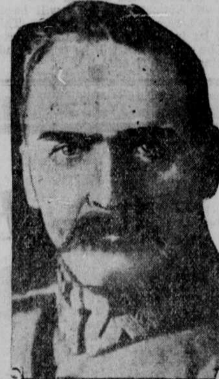
The greatest secrecy is being observed about the condition of Marshal Joseph Pilsudski, Polish premier and dictator, who is reputedly dangerously ill in his Warsaw palace.