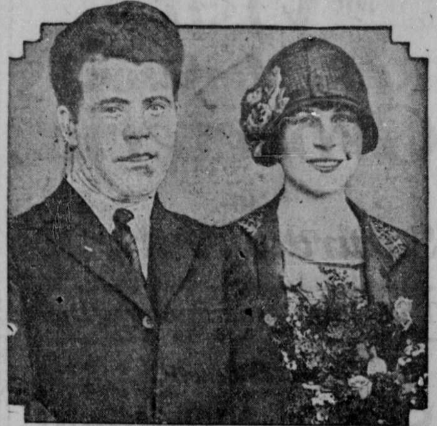
It's all over now. Jim Tully, famous writer of hobo stories, and his wife, are back in their Kings Road home, Los Angeles, after one of the most public reconciliations on record. Among those helping to iron out their differences were Judge Ben Lindsey of Denver, Rupert Hughes of Hollywood and H. L. Mencken of Baltimore and New York.