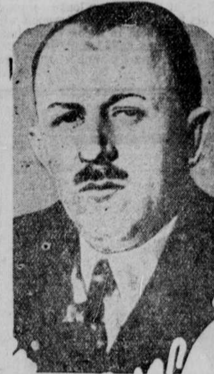
When Marshal Pilsudski tendered his resignation as Polish premier, Vice-Premier Kasimir Bartel, above, immediately formed a new government wherein Pilsudski retained the post of war minister. Now Bartel is expected to succeed him as premier.