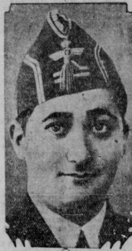
The Spanish aviator, Franco, is now preparing for an airplane trip around the world. He hopes to complete the trip in six weeks, using an Italian-built monoplane.