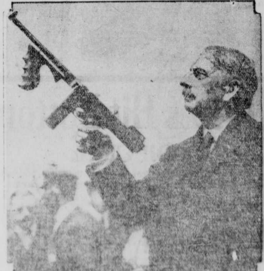
Brig. Gen. John T. Thompson of the U. S. Army, who has just been awarded the prize of $15,000 by the British War Office for the most satisfactory rifle submitted for adoption by the British Army. The new rifle, which is said to fire as accurately and nearly twice as fast as any rifle now in use, was designed by the American general, who was Director of Armaments of the United States Army during the late war.