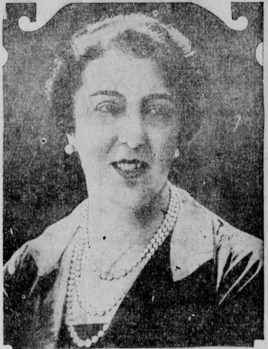
Senorita Nina Castellanos of Madrid, Spain, is to wed General Primo De Rivera, premier of Spain, according to recent reports.