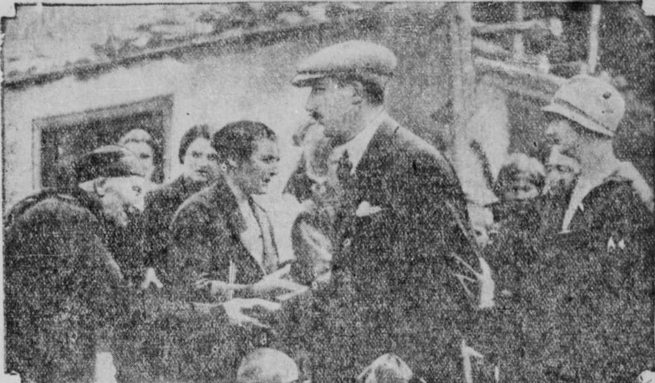
During their visit at Chirpan, King Boris and Princess Eudoxia of Bulgaria visited the areas affected by the terrible earthquakes which destroyed a number of towns and villages in Southern Bulgaria. More than a 100 people were killed and many hundreds injured.