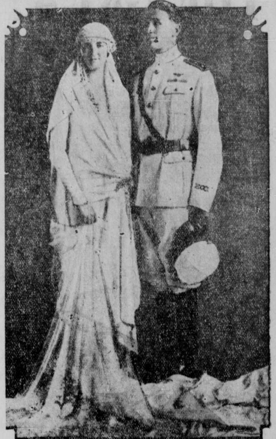
After a brilliant wedding, less than three months ago, Princess Anne of France and the Duke D'Apulia are reported living apart. The princess is reported to be determined to have the marriage annulled in order to marry the man she loves.