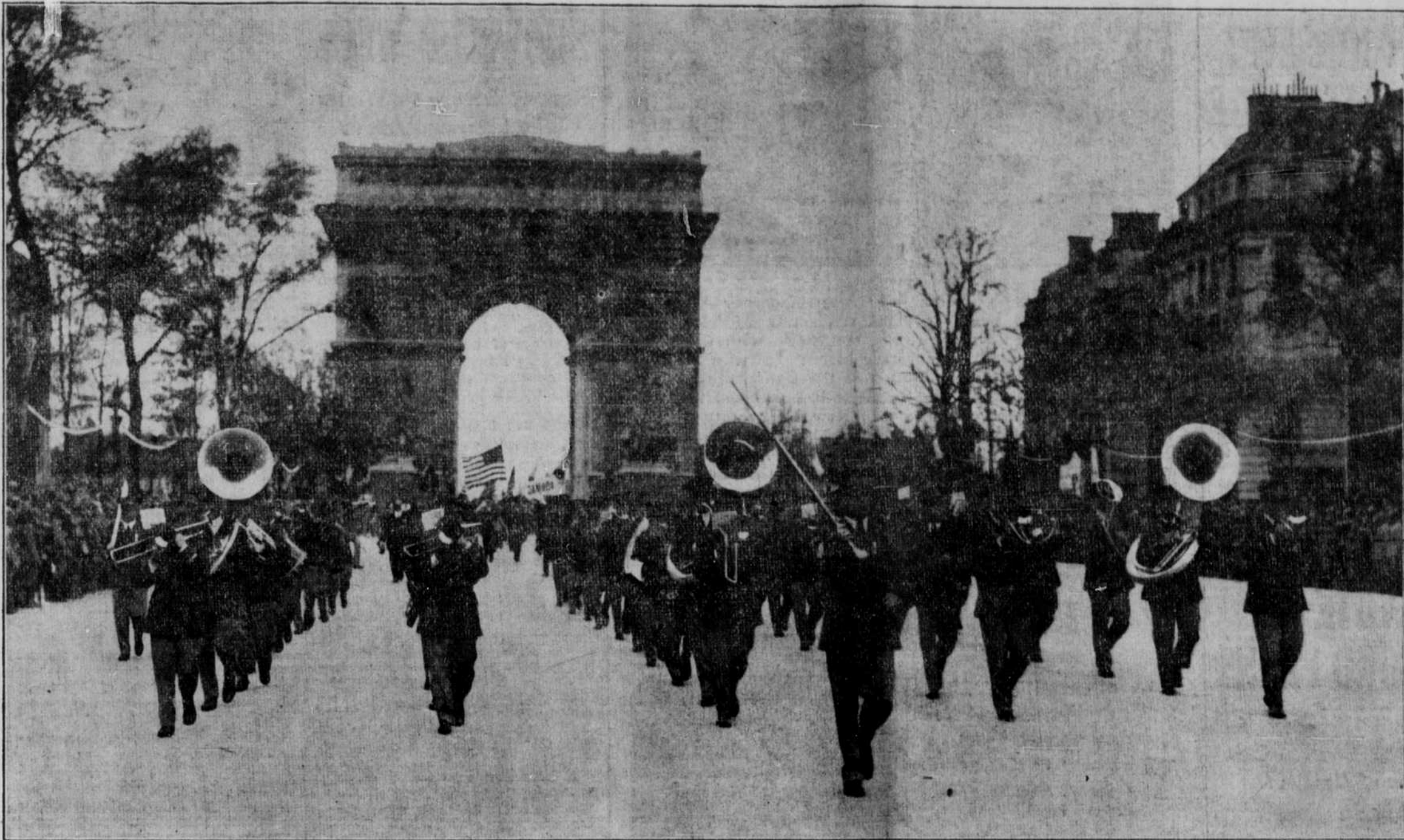
The above picture is of the Monahan Post Band of Sioux City, Iowa, as they paraded thru the Arch de Triumphe in Paris last fall. They took first prize in Paris and have also won first prize the seven years preceding from the all American Legion bands entered at the national convention. Also an orchestra of ten members will play for the dance when they come to O'Neill to play for the races July 3, 4, 5. The program at the Races will include many other attractions and will be the biggest celebration ever held in O'Neill. There will be fireworks, dancing, amusements of different kinds. Make your plans now. Ball Games, all kinds of concessions and amuse to celebrate in O'Neill.