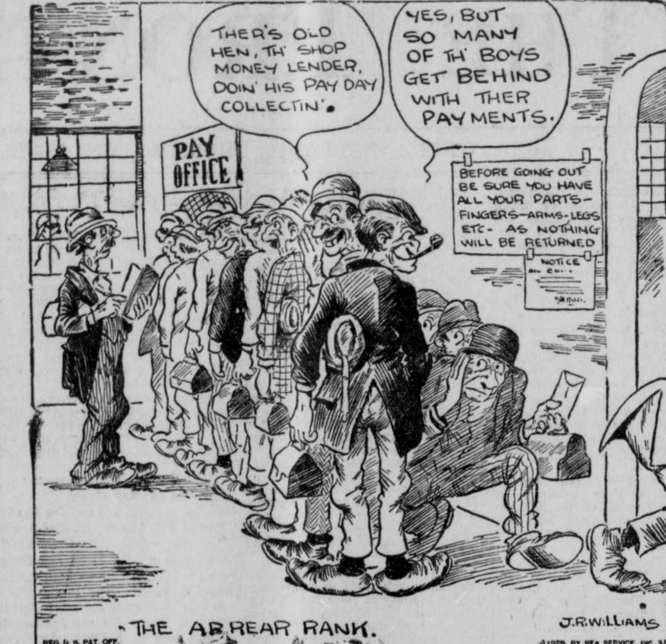
THE AB REAR RANK.