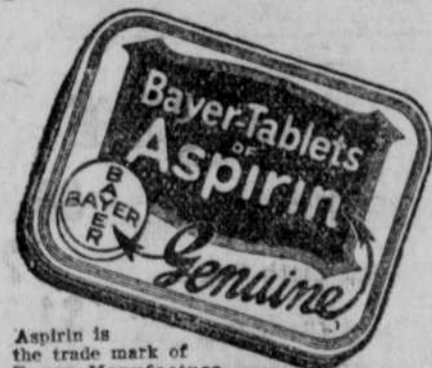
Aspirin is the trade mark of Bayer, Manufacturer of Monoclonalacetic Acid of Salicylic Acid

THERE is nothing that has ever taken the place of Bayer Aspirin as an antidote for pain. Safe, or physicians wouldn't use it, and endorse its use by others. Sure, or several million users would have turned to something else. But get real Bayer Aspirin (at any drugstore) with Bayer on the box, and the word genuine printed in red.