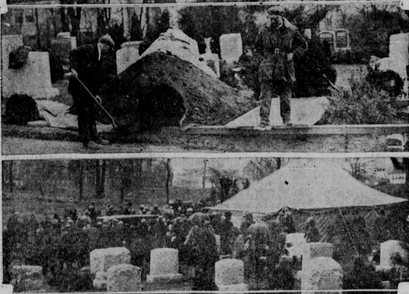
Top photo shows grave diggers preparing cemetery plot at Rosedale, N. J., for burial of Henry Judd Gray, executed at Sing Sing for the murder of Albert Snyder. Lower photo shows the funeral ceremonies,