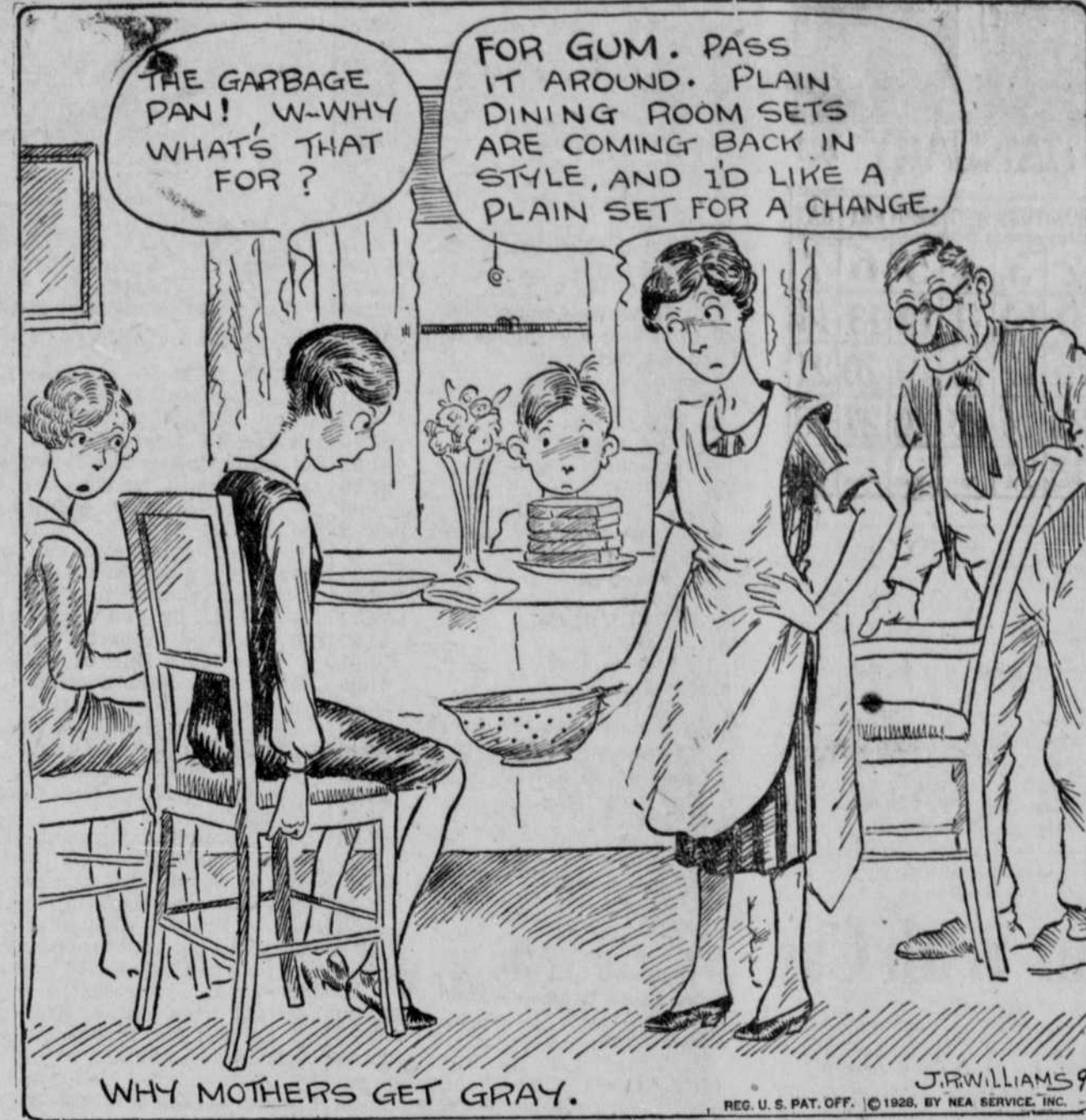
WHY MOTHERS GET GRAY.