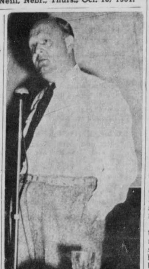
The Frontier Photo & Engraving

All migratory waterfowl hunters over 16 years of age must purchase a 1951 duck stamp in addition to their regular hunting permit.