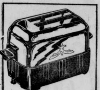
Two-Slice Automatic Pop-up Toasters $12.45

Modern red or white wall clocks with self-starting motor, clear numerals, sweep second hand.