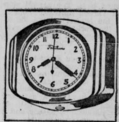
"Telechron" Electric Kitchen Clocks $4.50 plus tax

Modern red or white wall clocks with self-starting motor, clear numerals, sweep second hand.