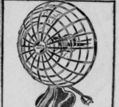
"Sterling" 10-Inch Size Electric Heaters $3.98

Handsome chrome-finish toaster with burgundy bakelite base. Color selector; year guarantee.