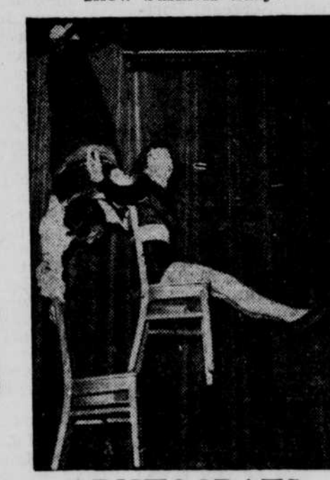
ARISTOCRATS OF BALANCE

Tumbling, balancing, contortion stunts you'll never forget!