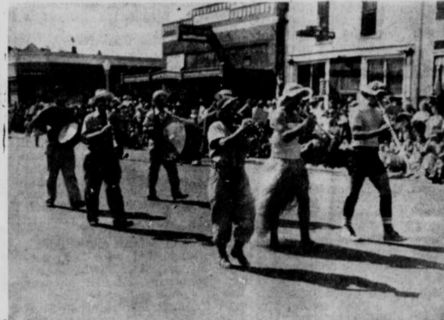
"Alexander's Rag Time Band" was interpreted musically by this molley group sponsored by Amy's cafe.