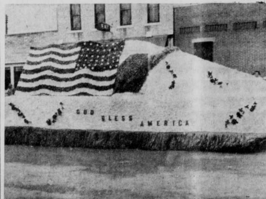
Farley-Tushla post of the American Legion, hay days sponsor, brought the parade to a climax with this color float which passed the reviewing stand to the strains of "God Bless America." The Legion's float won an honorable mention.