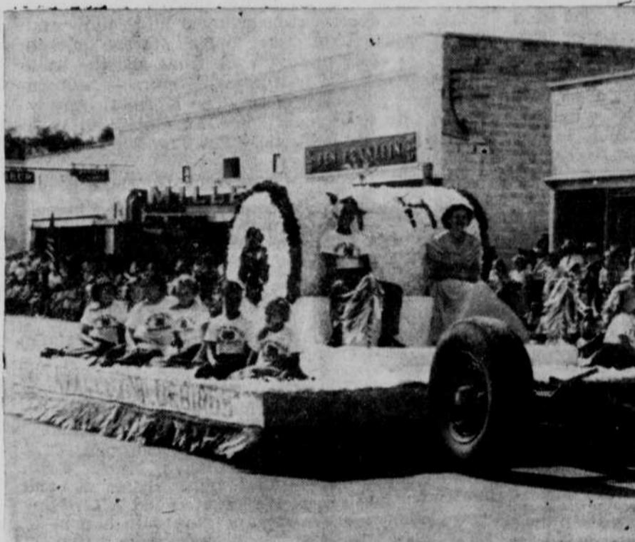
"Four-H Folks We Love So Well" was a colorful honorable mention entry of the Green Valley Bluebirds 4-H club.