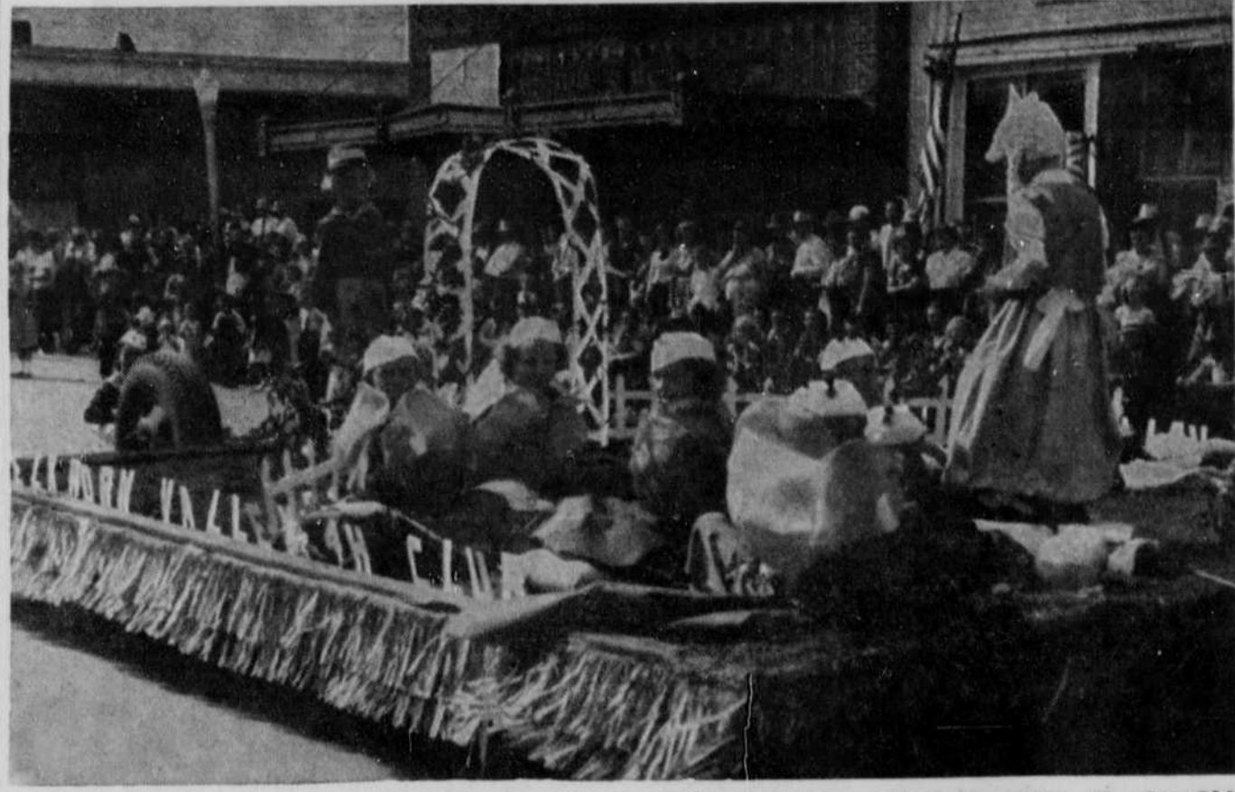
Second place award in the 4-H club division of Atkinson's hay days parade went to the