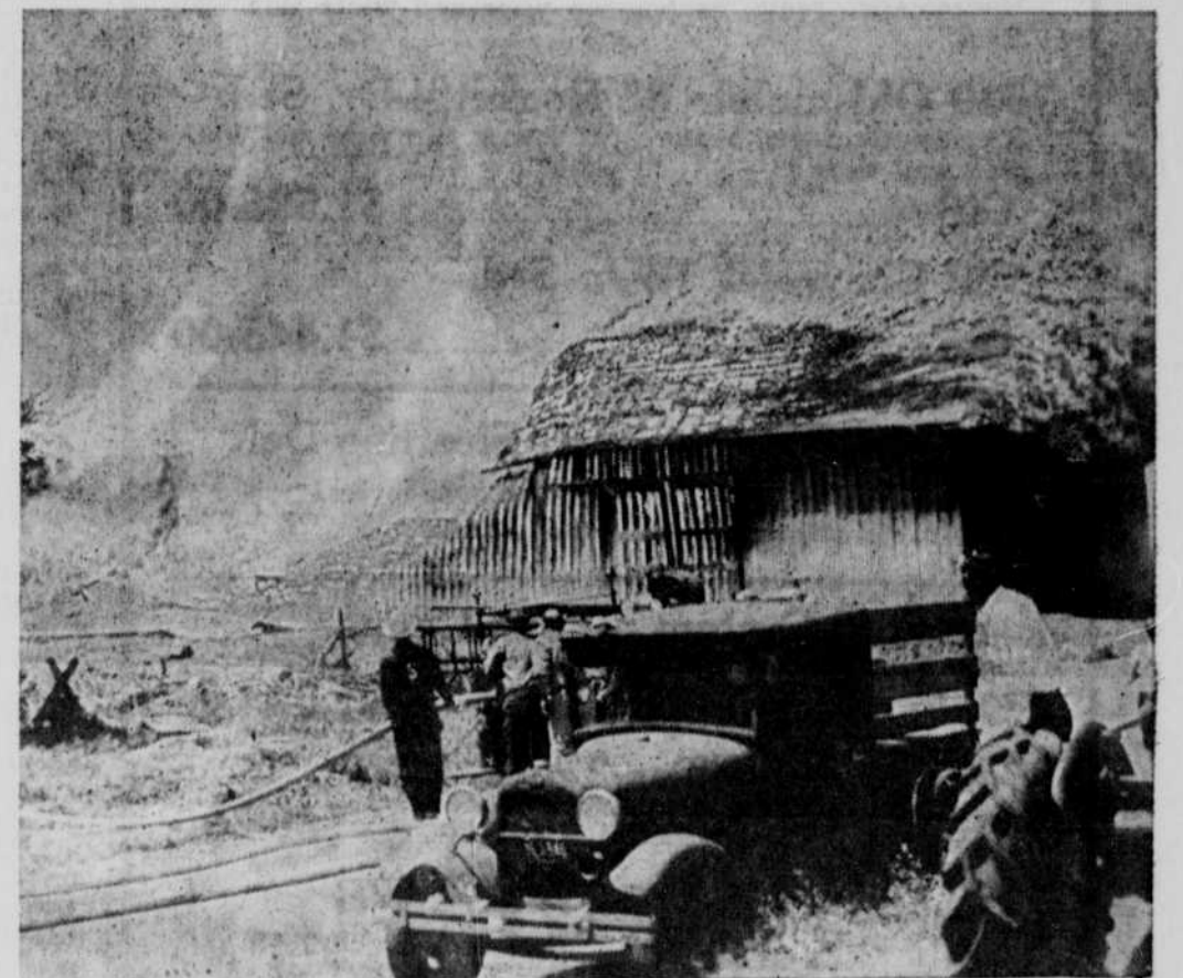
BUILT IN 1924 . . . The 125 x 60-ft. barn was built in 1924 by Bigelow & Farmer. Total loss was estimated in excess of $20,000. All of the contents were completely destroyed. Within a few seconds after the above picture was taken the barn had collapsed.

★ The Frontier FIRST With the Most News! FIRST in Pictures! FIRST in Readership! ★