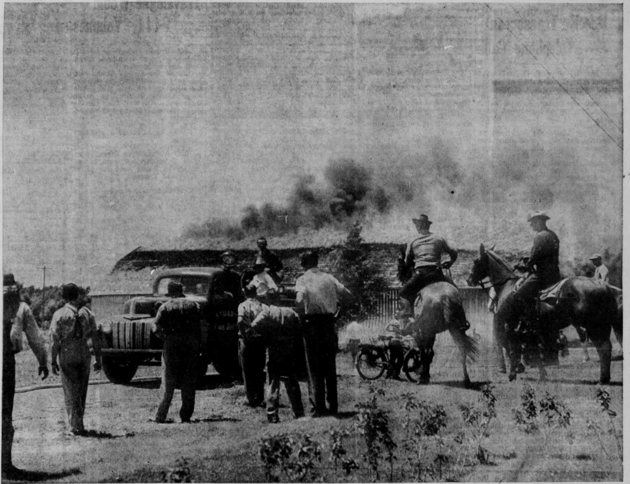
BIG HAY BARN BURNS . . . Stuart's Fourth of July parade had just finished, winning plaudits from a record celebration crowds, when unscheduled fireworks compelled the attention of the revellers. A large hay barn, situated at the rear of the city auditorium, broke out in flames of unknown ori-

gin and was reduced to ashes in less than 15 minutes. Stuart volunteer firemen were hindered by the spectators, but the fire gained headway so rapidly it was questionable if anything could have been done to save the barn.