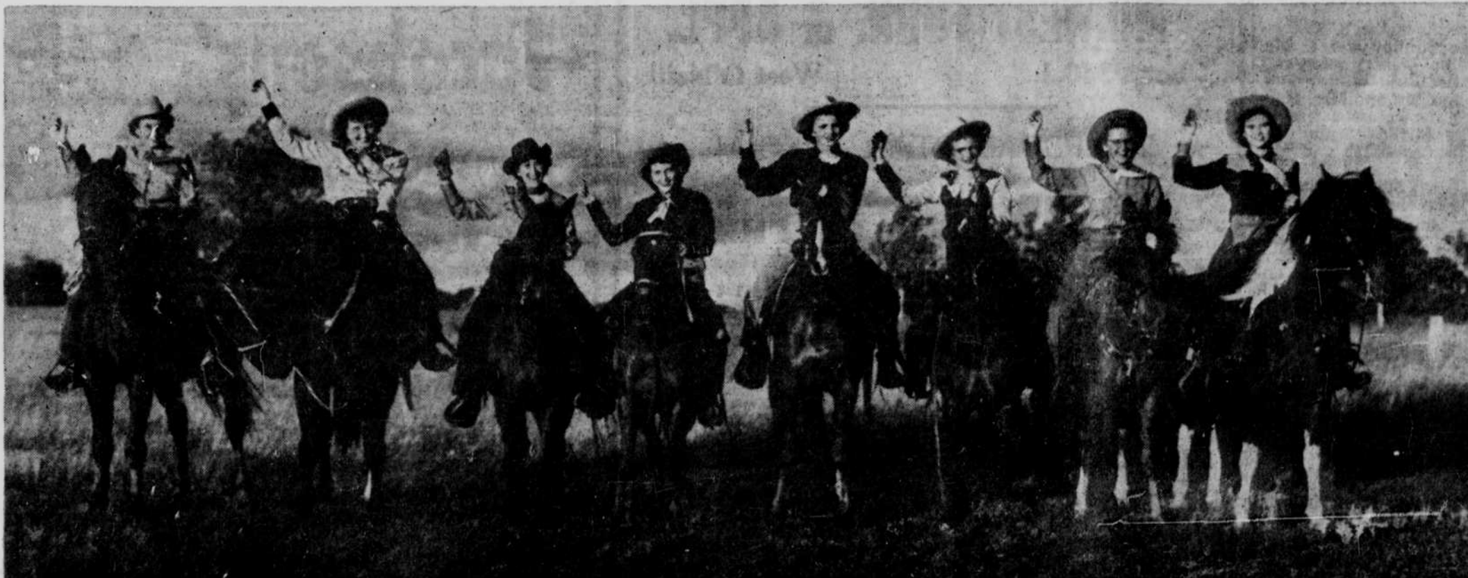
TOUGH JOB FOR JUDGES . . . The judges of the beauty contest in connection with the annual 2-day rodeo and Fourth celebration at Stuart had distinct problems in selecting a queen from this bevy of beauties astride

been a candidate several times before. She graduated from Stuart high school in 1948 where she had been a member of the glee club, mixed chorus and year book staff. She resides with her parents on a farm 1½ miles east of Stuart.