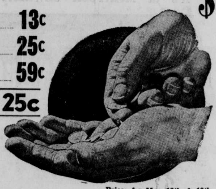
Prices for May 18th & 19th