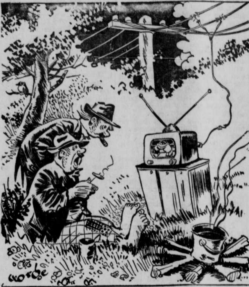
"Aw, dem bums can't wrestle!"