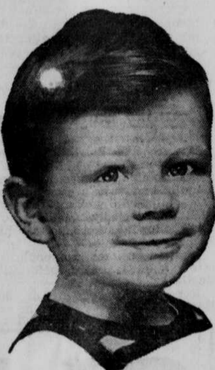
Prices for April 13th & 14th