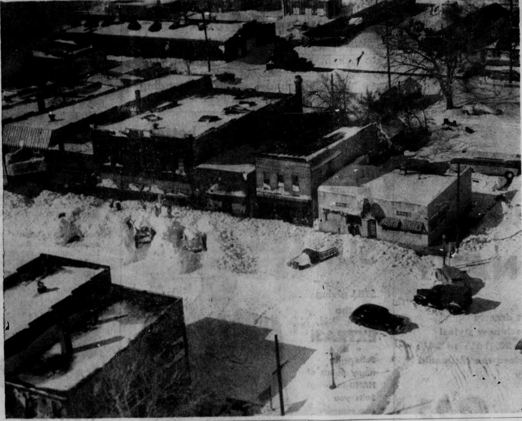
snow presented a sight never before seen by O'Neillites. Snow was piled high, too, almost obscuring the theater marquee on O'Neill's Douglas street. An aerial view of the town digging out from the Hurricane Blizzard is shown below.