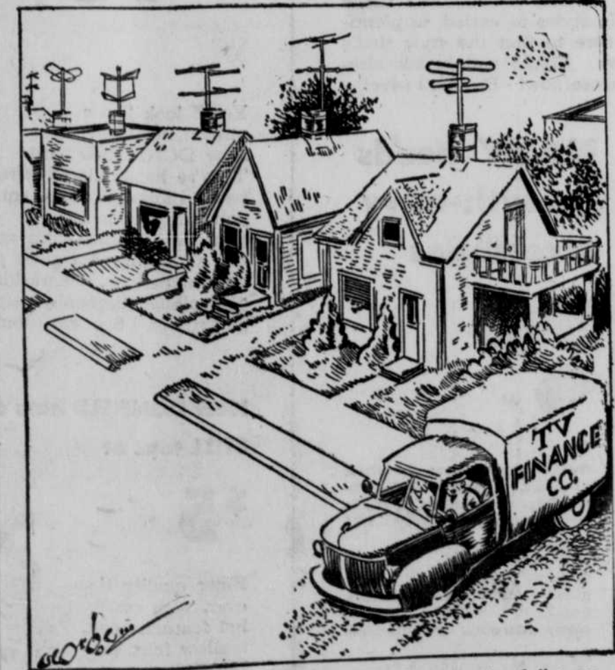
"We'll turn right, drive slowly and worry the folks on this street!"