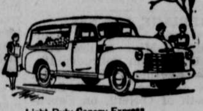
Light-Duty Canopy Express