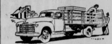
Medium-Duty with Merchandise Body