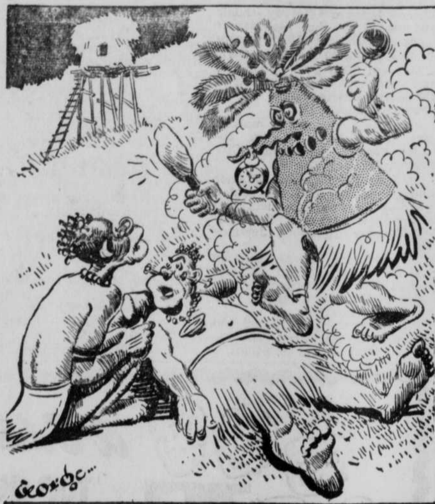
"I've just gotta get a different doctor; feathers aggravate my hay fever!"

canned beans and asparagus and they are so good with meat.