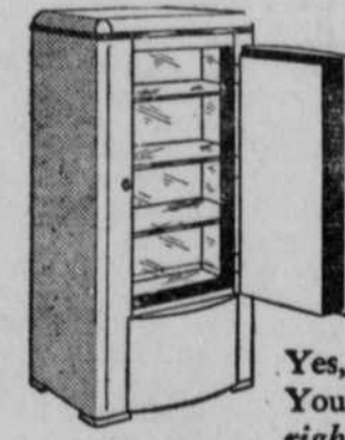
Amana 12 12 cu. ft. upright holds 420 lbs. of frozen food

Amana gives you the RIGHT SIZE and the RIGHT STYLE FREEZER for your family!