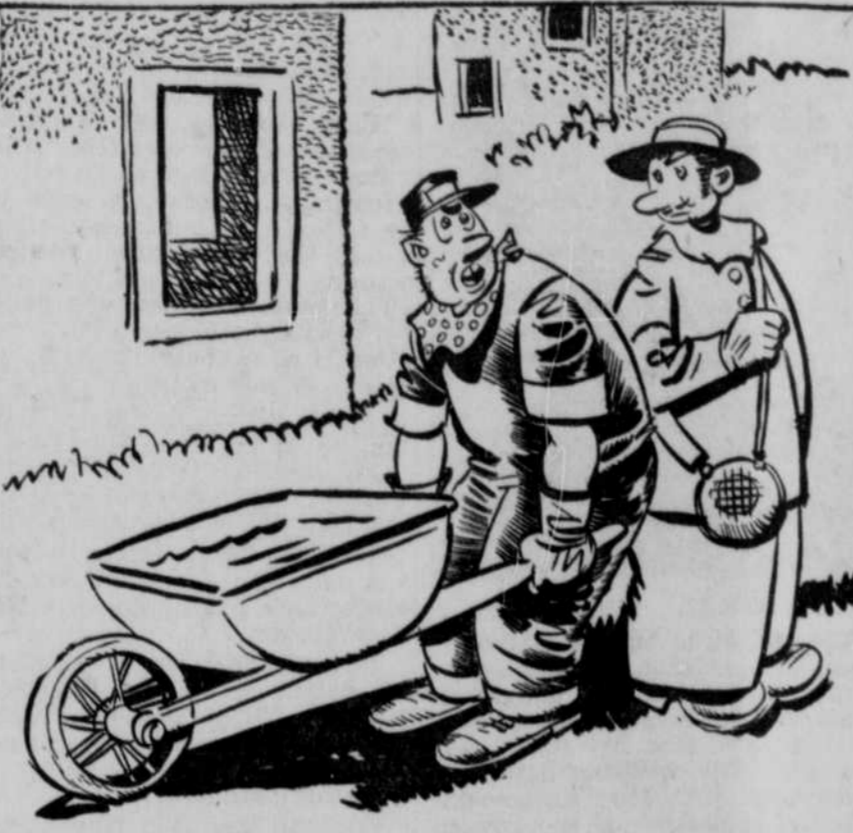
"They're sure speedin' things up around here since the emergency proclamation. The boss cut the legs off my wheelbarrow so I can't even rest!"