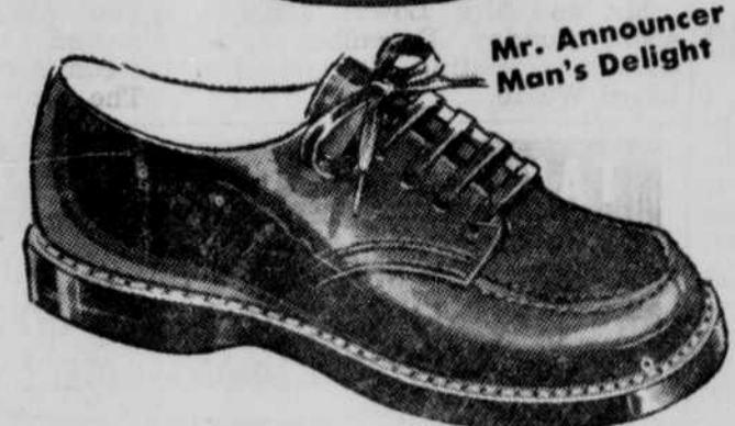
Mr. Announcer Man's Delight