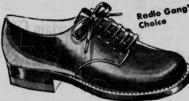
Radio Gang's Choice