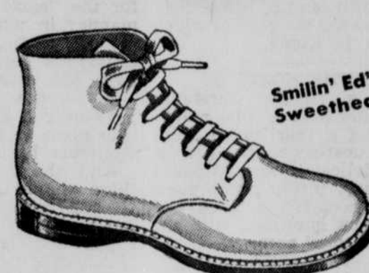
Smilin' Ed's Sweetheart