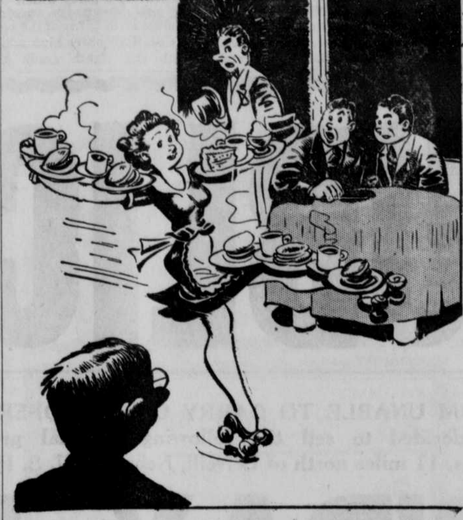
"Our new waitress is a DP. She used to be in a skating act in vaudeville."