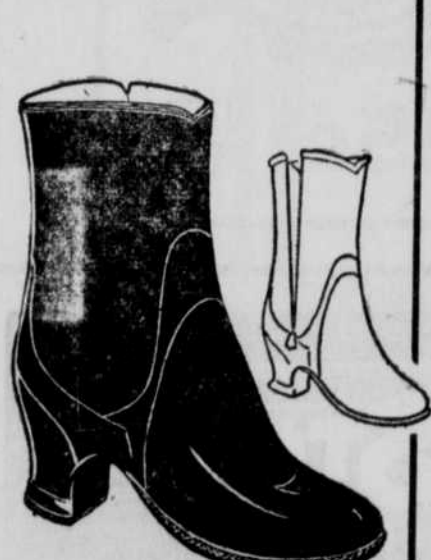
Women's Nu-Look zipper boot in new 9-inch height. Shiny black finish rubber, cottonfined for warmth. 4 to 9..3.98