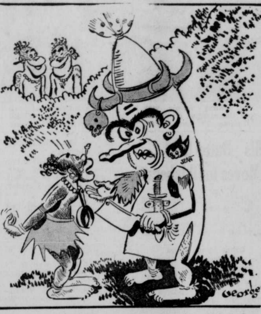
"The doc is dressed in a special outfit today. He's trying to scare some people into paying their bills."

FOR SALE: Two 5-acre plots, ideal for building, within 8 blocks of O'Neill schools, just outside city limits. — R. H. ("Ray") Shriner, O'Neill, phone 106. 21c