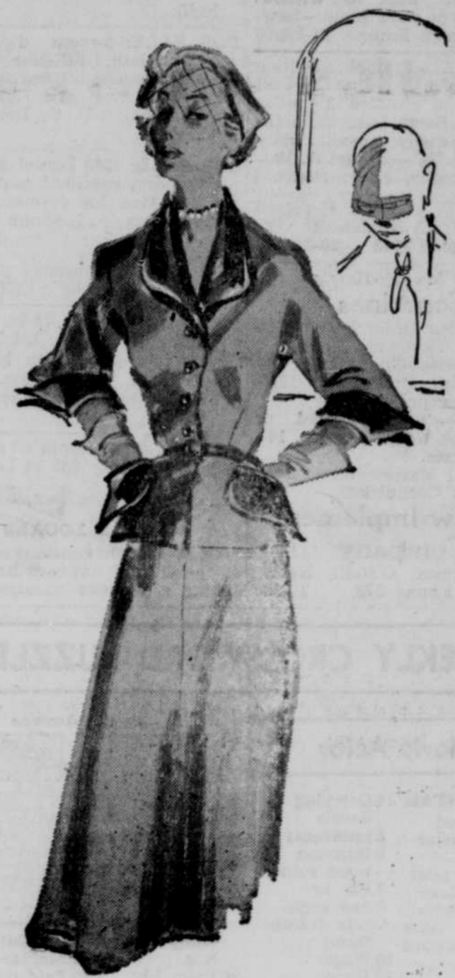
Pack and Go Suit

ABOVE: See the sharp, slim lines of the skirt . . . the low-placed pockets on the jacket . . . the easy, casual cut. And the quality of Nelly Don's sleek polished rayon gabardine is superb! Crease-resistant, with sheen that gives it the look of a fine worsted. This good-looking suit in cranberry, green, tan, and winter navy. 12 to 20 sizes. $14.95