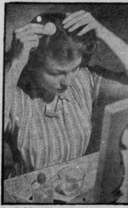
A fashionable fall hat suffers when Milady's hair appears lack-luster. Unsightly dandruff, however, can be prevented when warm oil is applied to the hair part with sterile cotton.

NOW that the first nip of autumn is in the early morning air, it's time to think of conditioning your hair so that it will look its best with new fall millinery.