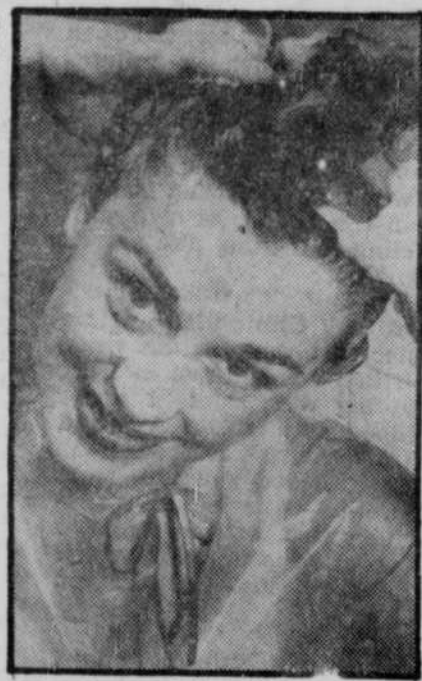
To safeguard the silkiness of her hair against the soap film or mineral deposits found in rinse water, the alert lady (above) adds water conditioner to both shampoo and rinse water.

And make certain no residues of shampoo or minerals from the water are left in your hair. If the water you use for hair washing is not ideal, you might find it helpful to use a water conditioner in both your wash and rinse waters. These aid your shampoos in lathering more abundantly, and help strip dulling films from your hair.