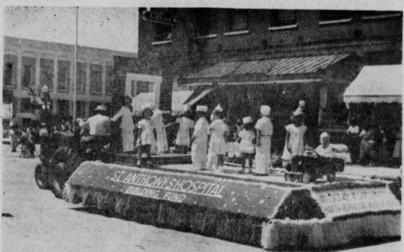
St. Anthony's hospital float, featuring small fry as hospital "staff," compelled wide attention during O'Neill's progress parade. Even a litter and inhalator were "manned." Entry won honorable mention in the heavy float division.