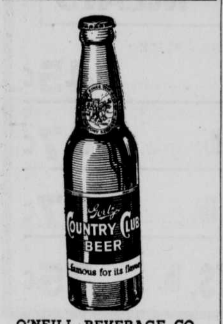
O'NEILL BEVERAGE CO.

Chenille Spreads Solid color and white floral basket design. Full size 90" x 105" in all wanted colors. Big Value! 7.77