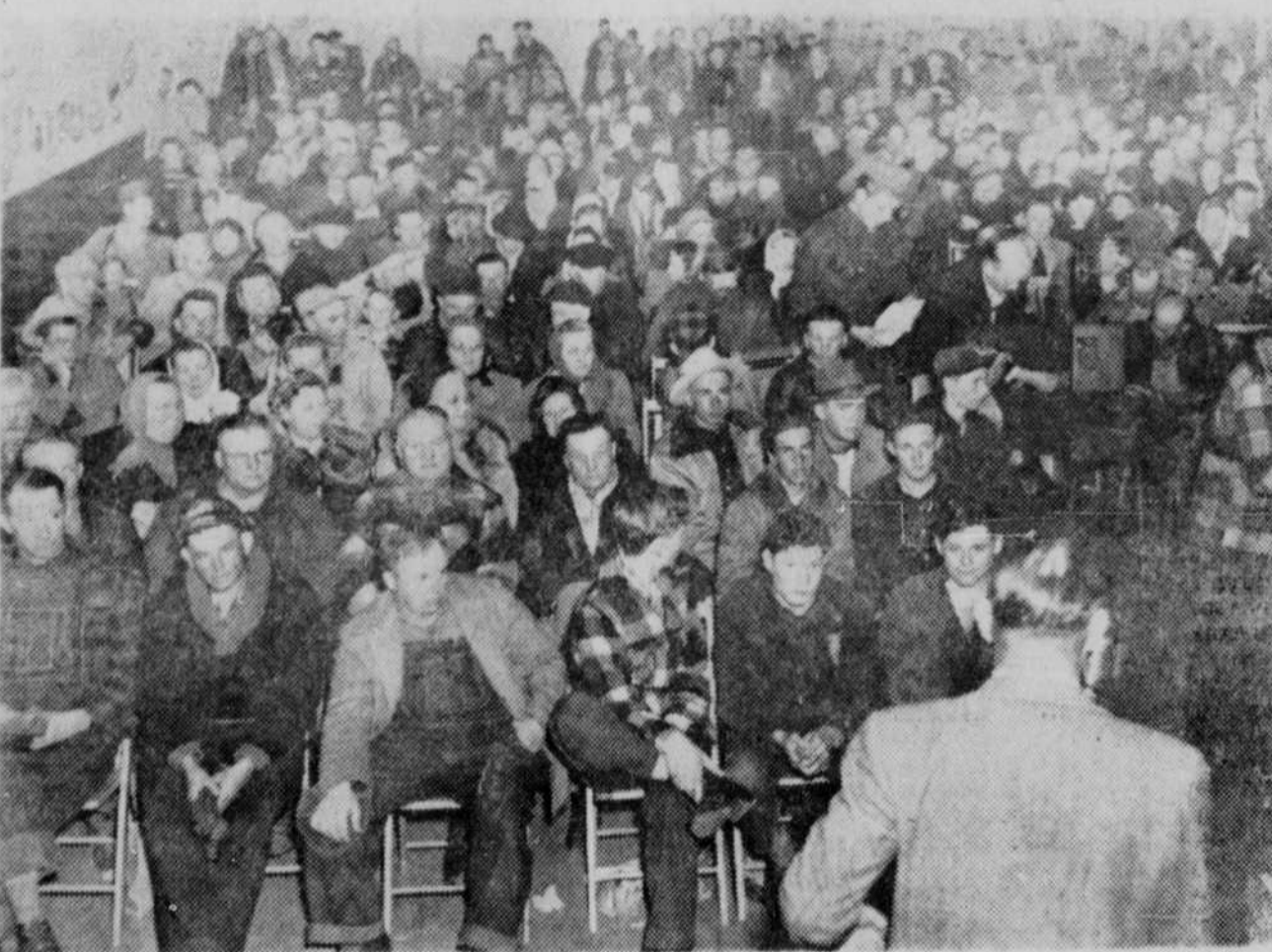
500 WITNESS IMPLEMENT SHOW . . . Five hundred men and women gathered Wednesday, March 1, at the American Legion club here for the annual John Deere day entertainment,

ALCOHOLICS ANONYMOUS Write: Box 481 or Phone 180 O'Neill, Neb.