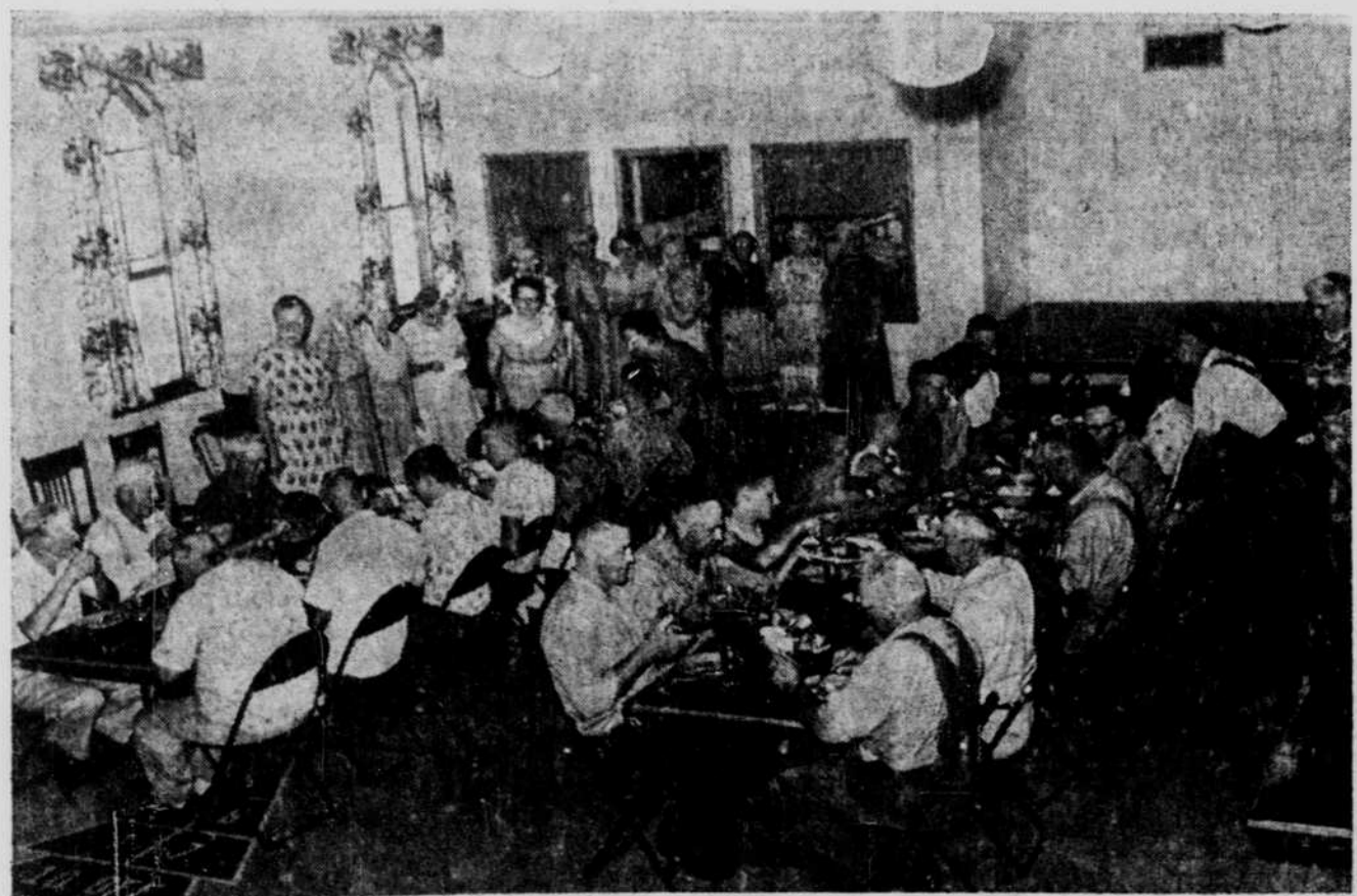
MEMBERS OF THE INMAN METHODIST CHURCH gathered last Saturday to take part in the annual Methodist church hay-raising. The church fronts 114 acres of hayland south of Inman. Members of the crew are shown here enjoying a noon meal furnished by the ladies of the church. Approximately 100 tons of hay were put up this year by the volunteer crew.