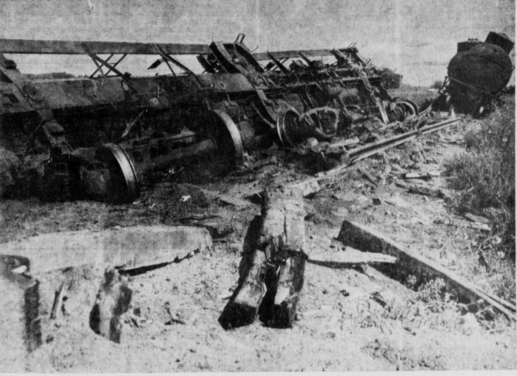
TORN UP TRACK and overturned railroad cars at the scene of the train wreck Friday afternoon two miles west of Clearwater.