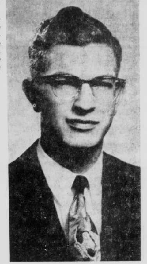
he caught hold of a life jacket.