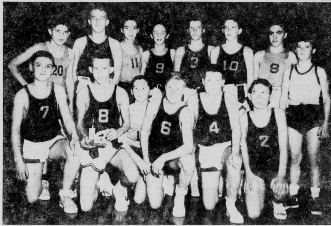
CHAMBERS JUNIOR HIGH basketball team finished second in the Sandhill Gateway conference tourney at Clearwater. The Chambers lads defeated Brunswick and Clearwater but were edged from the top spot by Inman 56-51 in the final game.