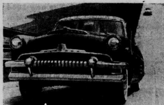
Make driving as easy as you wish with optional power steering, power brakes, 4-way power seat, electric power windows, no-shift Merc-O-Matic Drive.