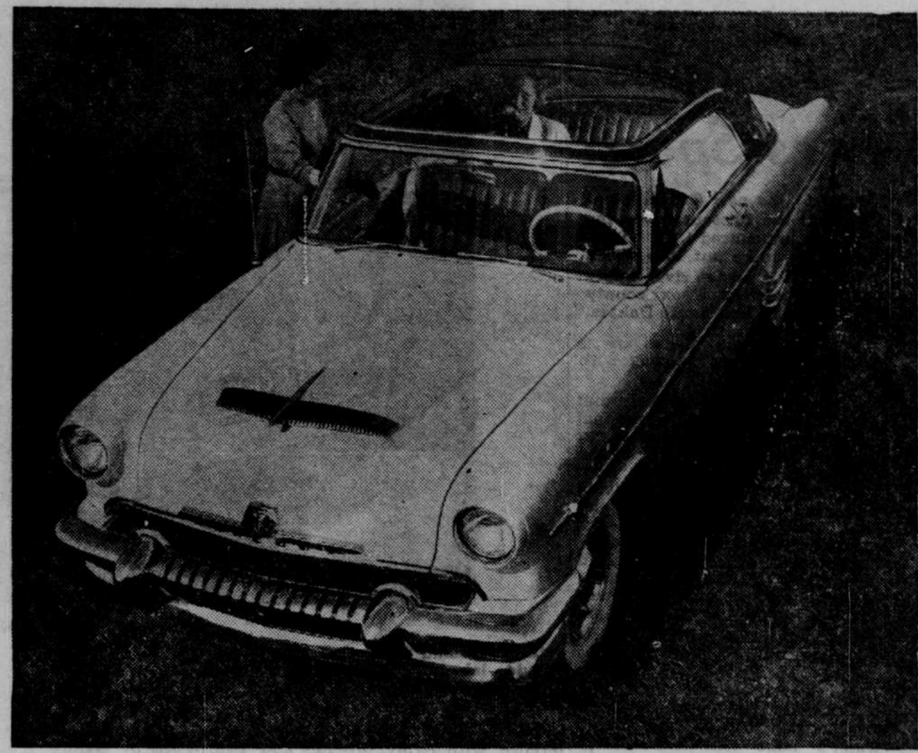
Mercury's Monterey "Sun Valley" . . . new body styling.