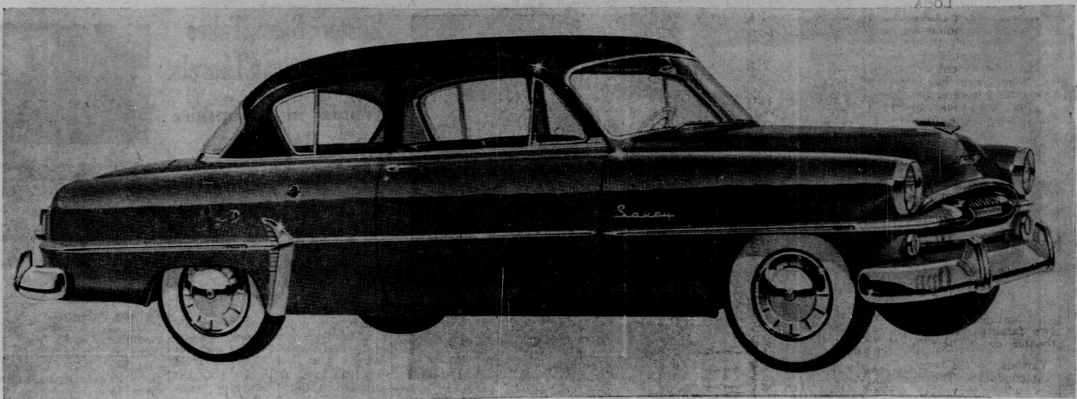
The beautiful Hy-Style Plymouth for '54 . . . Chrysler corporation's number one car.