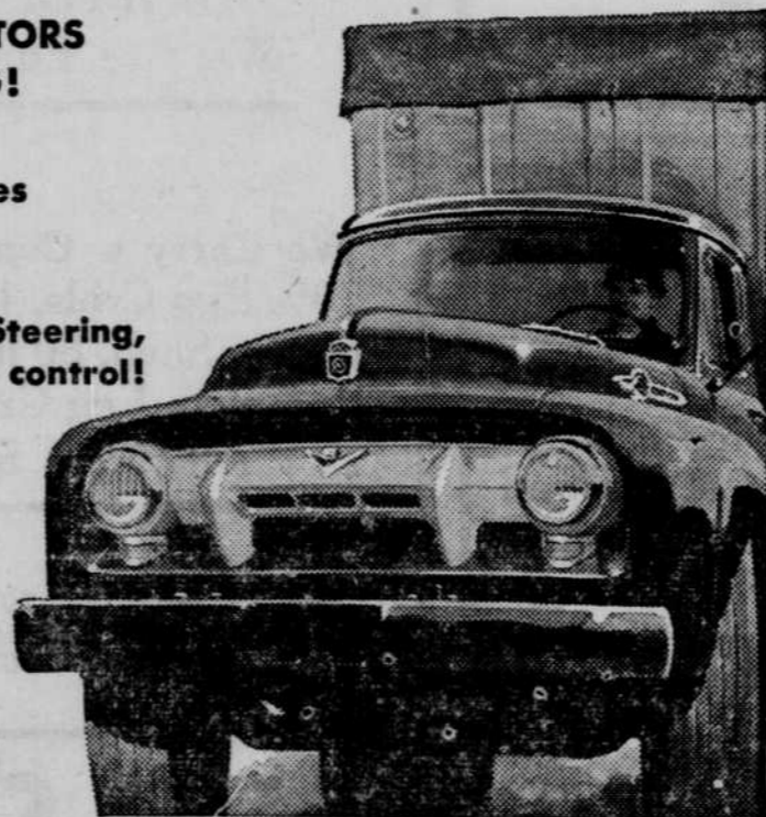
New Ford F-900 Big Job, G.V.W. 27,000 lbs., G.C.W. 55,000 lbs.