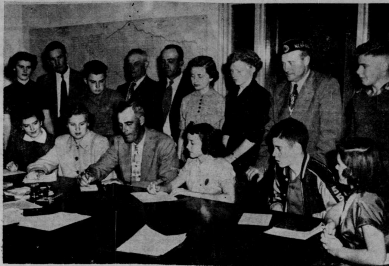
Study with Holt Supervisors