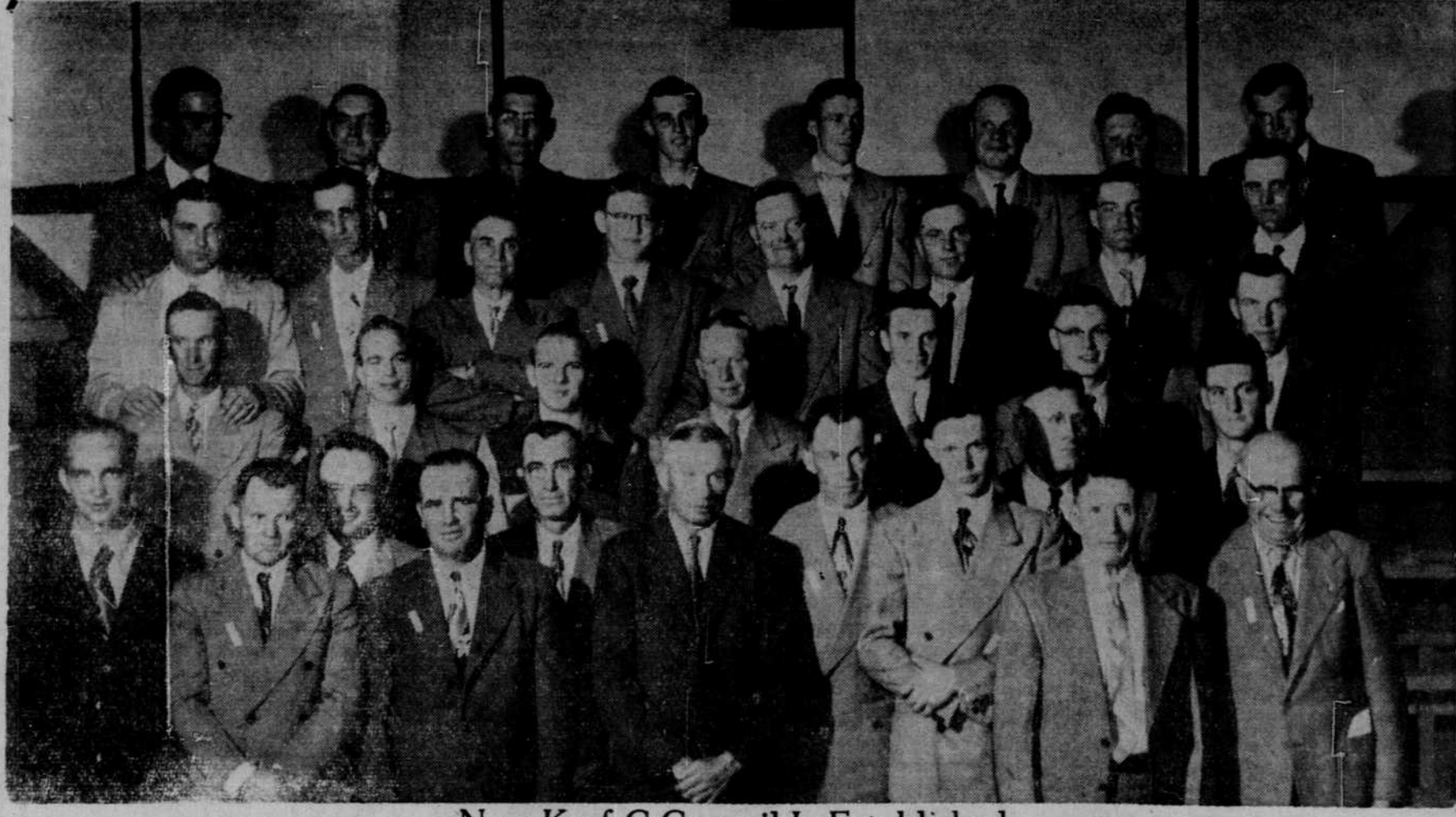
New K of C Council Is Established