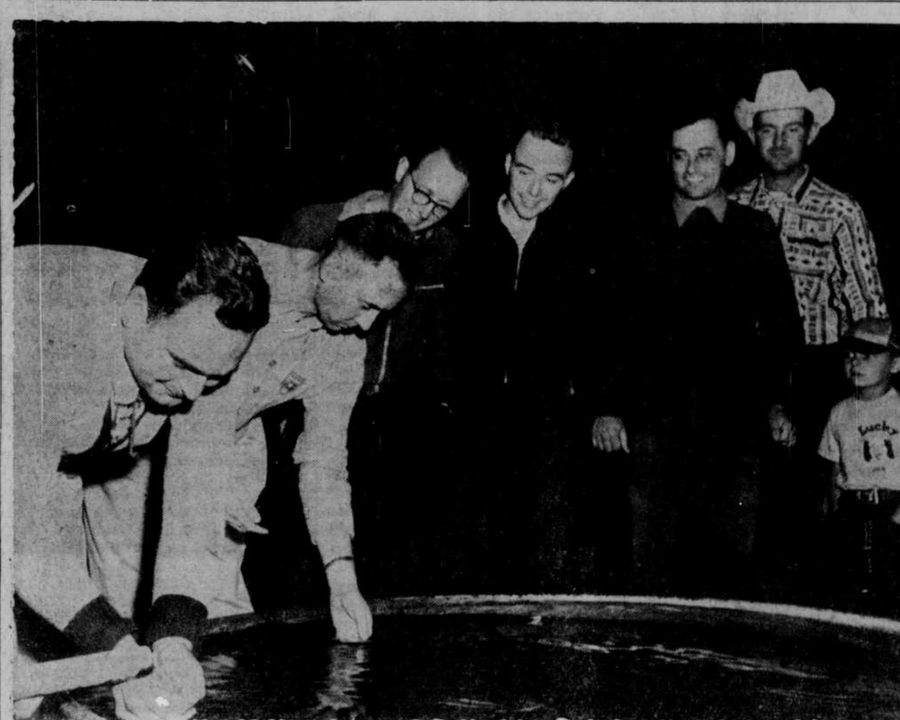
Europeans Visit Chambers Farms