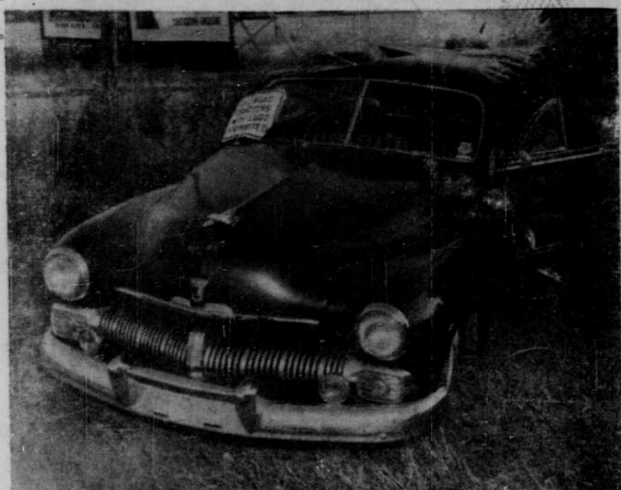
Gonzalez machine . . . body five feet away.