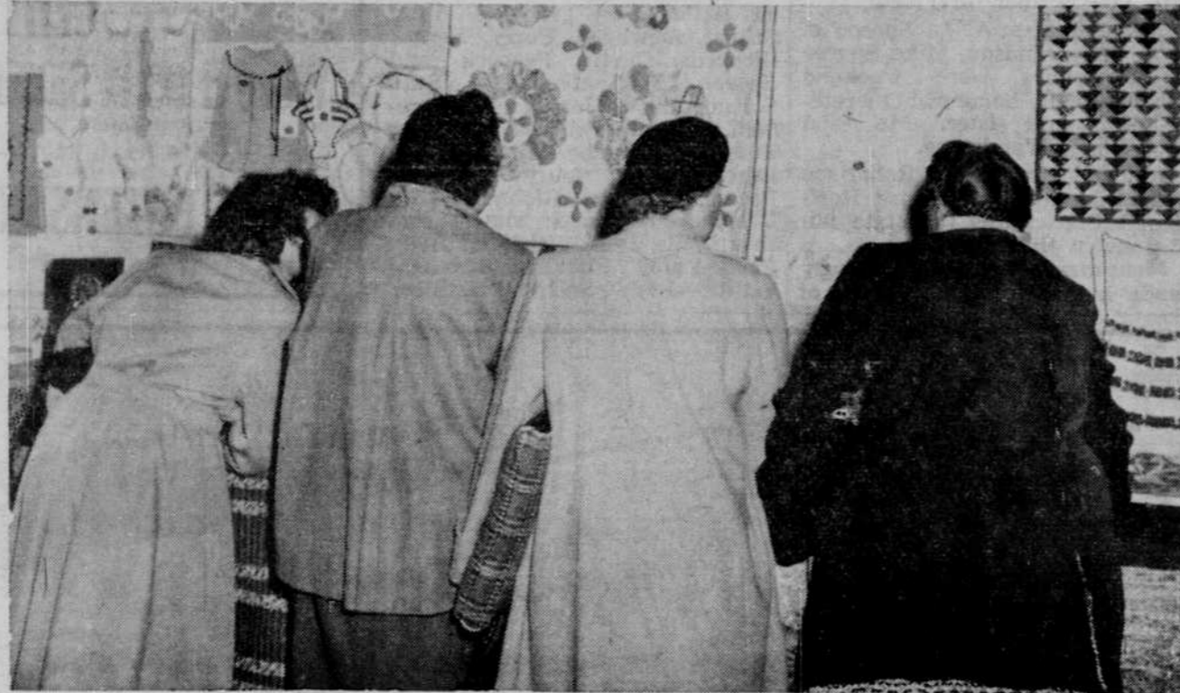
Needlework art captures the interest of these fair-goers, who were unmindful of a picture about to be taken in the needle art