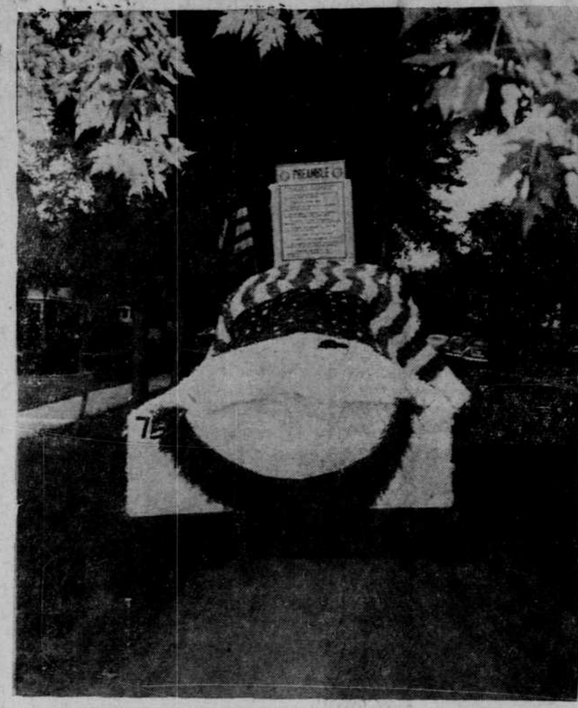
One of the most colorful floats in Atkinson's 1953 hay days parade was the "Preamble to the Constitution of the USA," a patriotic theme, entered by the Legion post.