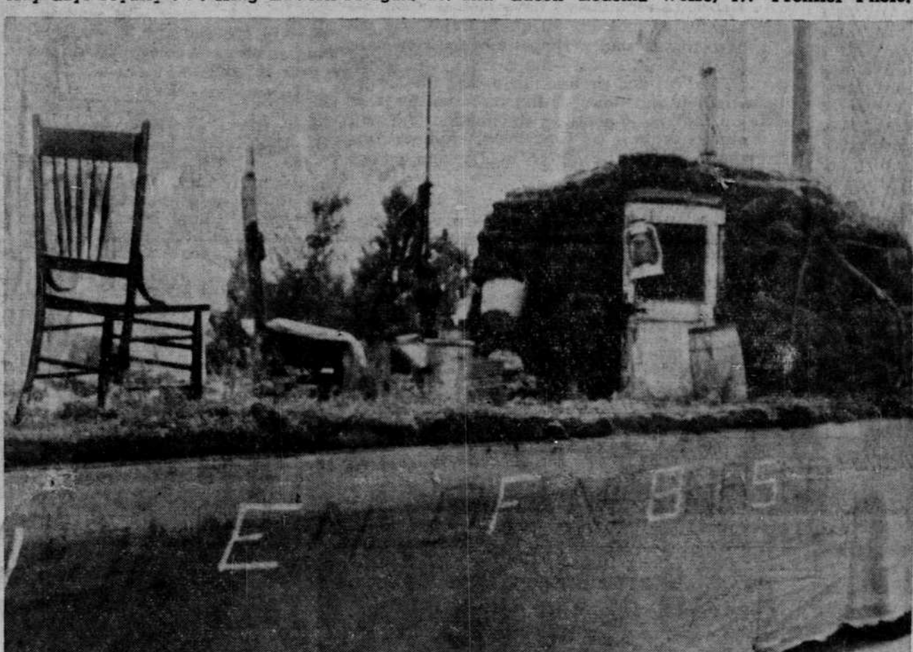
Sodhouse and primitive utensils . . . grand prize winner.