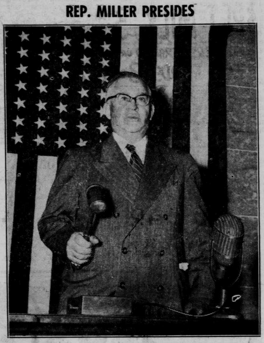
REP. MILLER PRESIDES Congressman A. L. Miller, Republican, of Nebraska's Fourth District, is shown on the rostrum in the chamber of the House of Representatives, where he presided recently. Speaker of the House Joseph W. Martin, Jr. often calls upon Republican members to take the chair when his duties as Speaker require his absence from the chamber.