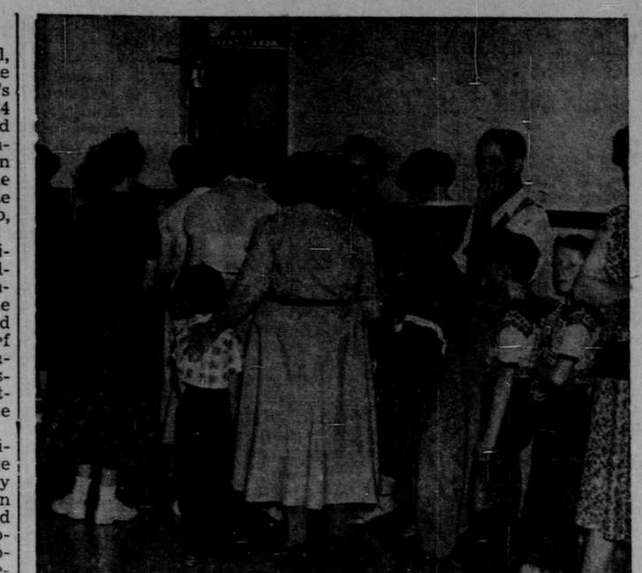
This is a portion of the overflow crowd in the second floor courthouse lobby for Saturday's now-famous McLimans trial. Those with seats in the courtroom congregated early.