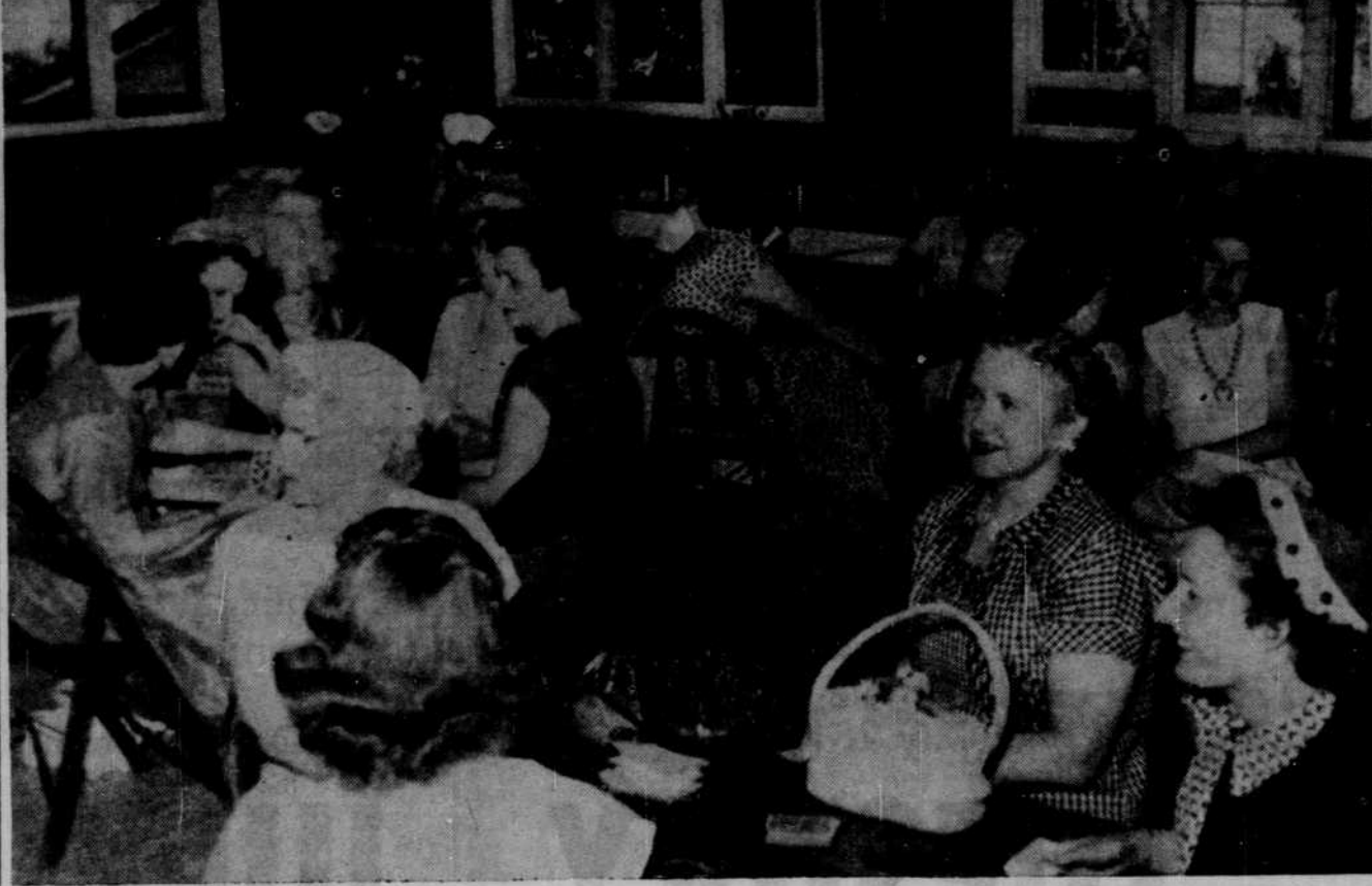
Ladies occupied during golf tourney . . playing bridge.