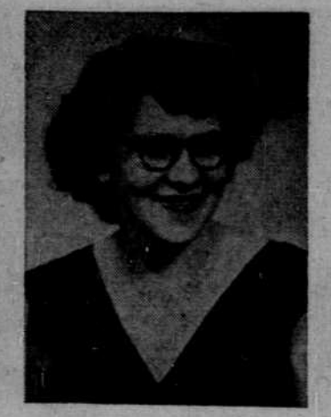
LaVern Hamik -O'Neill Photo Co.