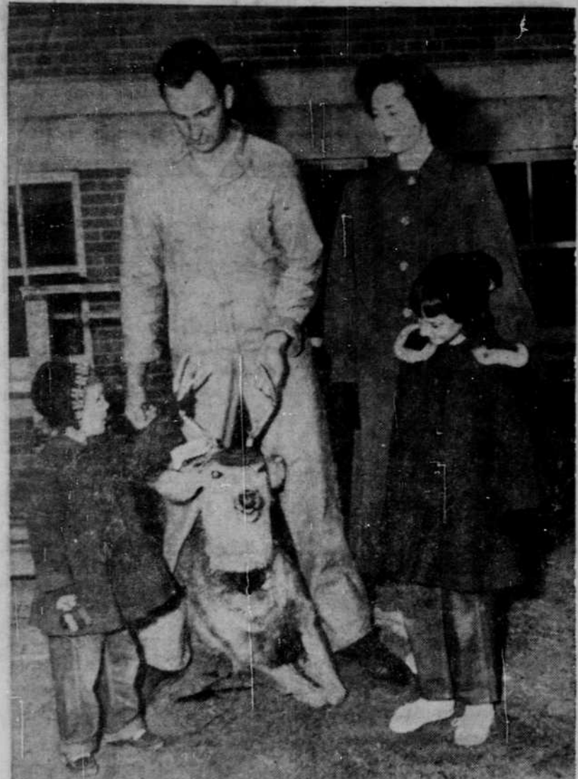
"Voice of The Frontier"