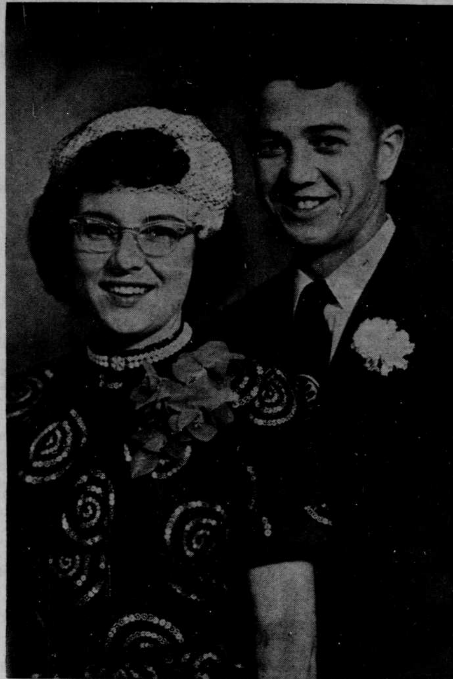
Wed at O'Neill