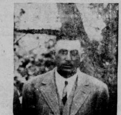
Rites Held Here

The American Legion auxiliary held its annual Christmas party in the Legion club rooms Wednesday evening.