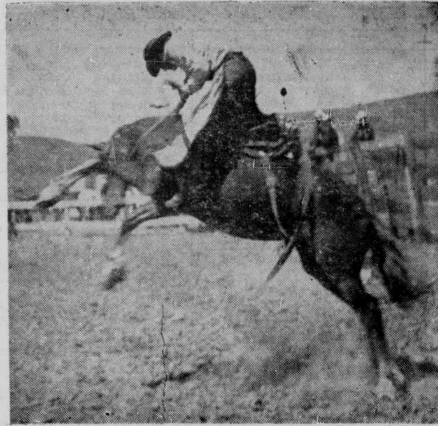
Ride 'em, cowboy! This admonition frequently will ring out across the arena during the big rodeo entertainment at the 62nd annual Holt county fair at Chambers. The rodeo will be night-time entertainment at this year's fair — Wednesday and Thursday, August 18 and 19.

All roads lead to Chambers during fair week!